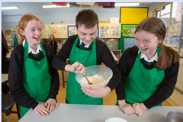
Cooking in Home Economics