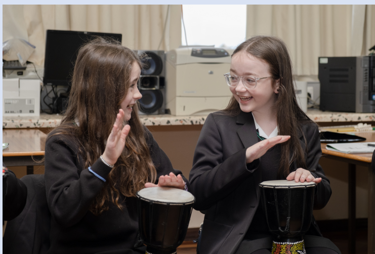
Having fun in Music