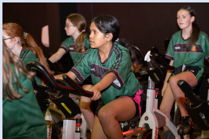
Having fun in PE