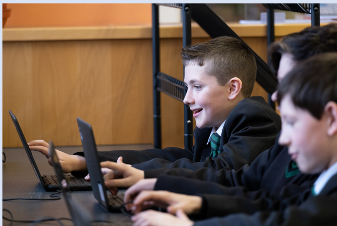
Programming in ICT