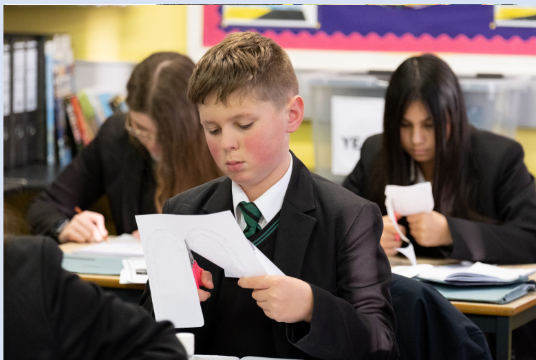
Learning in History