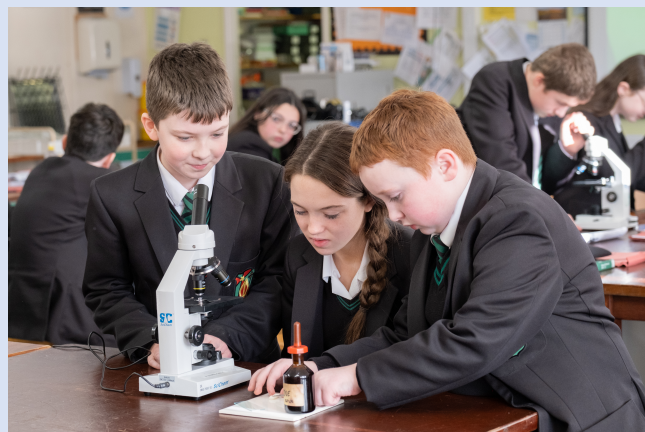
Experiments in Science