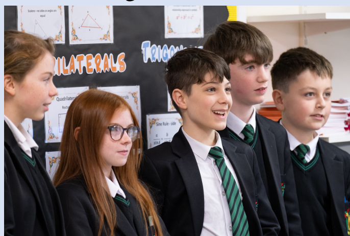
Answering out in class