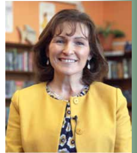
"We seek to inspire each other, to be innovative in our practice, and to excel in everything we do"

We expect our pupils to work hard, to fulfil their potential, to be challenged, to have self-belief, to achieve even more than they think is possible, and to prepare themselves for adult life. Pupils will prosper when they are happy and healthy; others may require a little patience, time and support to achieve highly. There is nothing wrong with that! We are extremely proud of our Examination Results. We believe that a growth mindset is essential for success and we know that our pupils can exceed, even their own expectations. Qualifications are important and will open many doors, but your character and determination are equally important.