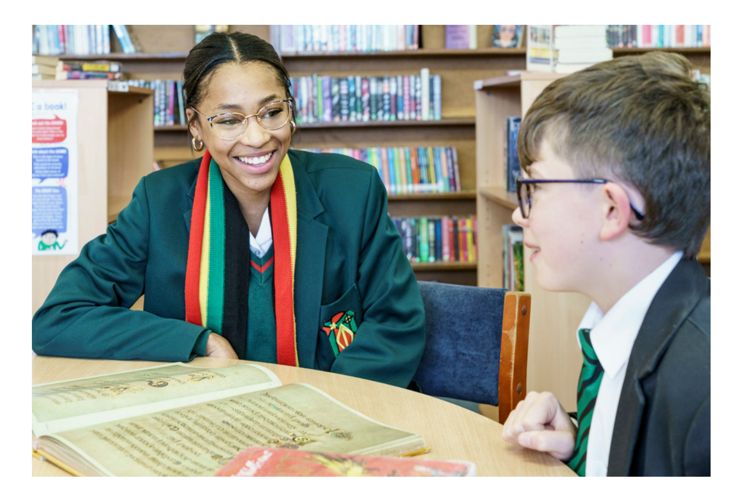
FIND OUT MORE IMPORTANT INFORMATION ABOUT YOUR NEW SCHOOL BY FOLLOWING THE QR CODE TO ACCESS HOLY TRINITY COLLEGE'S P7 MICROSITE